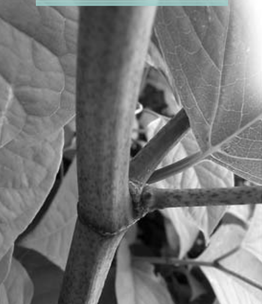
Photo 1 Close-up of Japanese knotweed stem

Japanese knotweed can spread at an alarming rate of 7 m per season in all directions. With its massive seed production Himalayan balsam tops this with a quoted 20 m per season in all directions. Yet despite these statistics there is currently no legislation that encourages landowners to do anything about these plants!