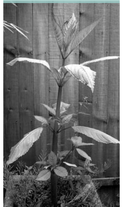
Photo 3 Leaves and stem of Himalayan balsam

creamy white flowers hanging in clusters from the leaf axils (point at which the leaf joins the stem) ( Photo 2 ). The underground rhizomes are thick and woody with a knotty appearance and when broken reveal a bright orange centre. The rhizome system extends 2 to 3 m into the ground and up to 7 m in all directions from the limit of the surface growth.