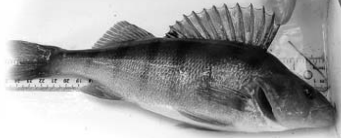
Perch from the River Sence

ward for the Amateur Category. In their citation the is used. The project was undertaken in collaboration reports on his BSc project completed in 2008.