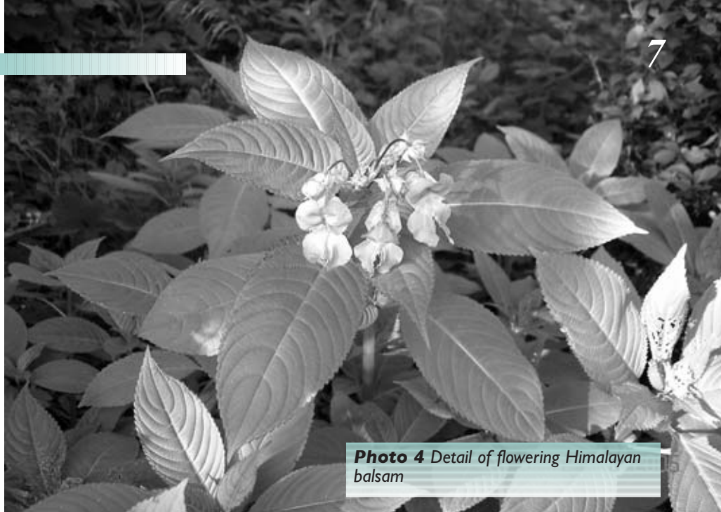
Photo 4 Detail of flowering Himalayan balsam