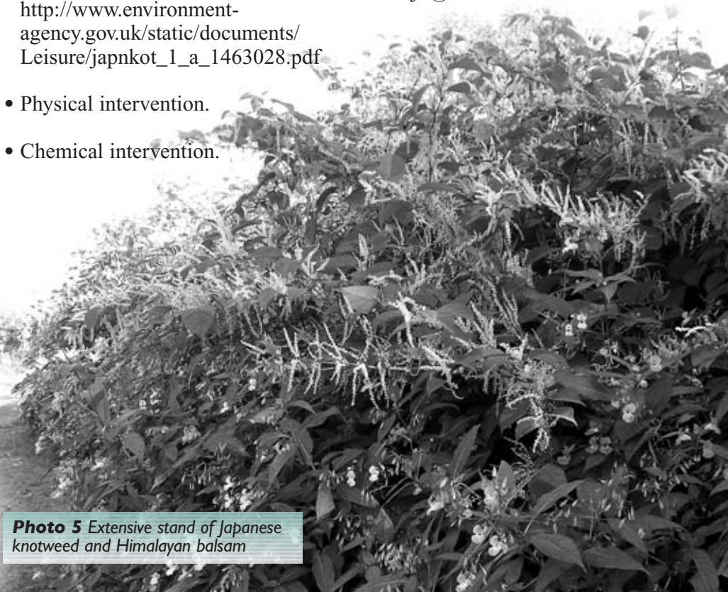
Photo 5 Extensive stand of Japanese knotweed and Himalayan balsam