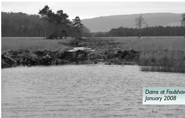
Dams at Foulshaw Moss Reserve, January 2008

Community involvement has been encouraged through a programme of work parties, guided walks and reserve open days. New paths and walkways have been created to allow visitor access all year round, and viewing towers and hides have been constructed. The site now has interpretation signs, marked trails and species and habitat information. It is used by schools and colleges for educational visits and volunteer work parties regularly assist with practical conservation work on the site.