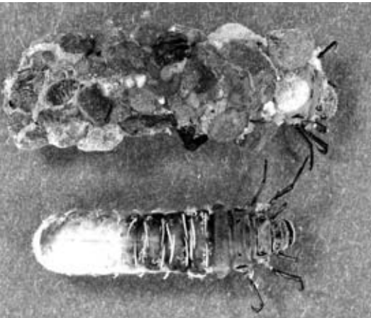
Limnephilidae sp. Order Trichoptera with case and without (from River Sence). Micro-photography courtesy of S. Taylor

Both the Control site (site 1) and site 2 showed grades A, A & A in Spring 2008; however, the percentage probability of these results being correct was higher for site 2. The assumption that site 2 would have lower scores at the baseline in view of the results for sites 3, 5 & 7 is merited by the Autumn 2007 results where it scored lower than site 1 and in line with the other site scores which was prior to the pollution incidents. It can therefore be concluded that site 2, with the installation of the groyne, improved over the control site without a groyne. It is also reasonable to assume that changes to upstream land use account for the increase in quality at the control site.