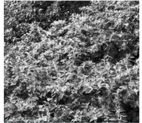
Photo 2 Flowering stand of Japanese knotweed

The plant flowers late in the season (August to October), with small